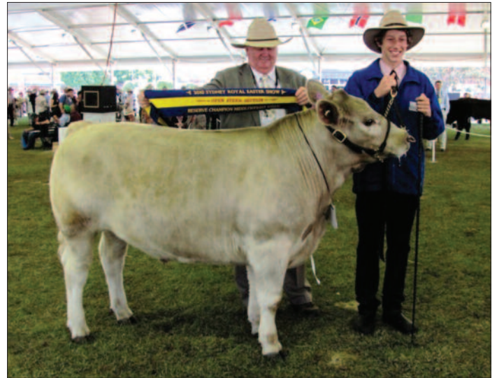
The Australian Square Meaters breed is being rewarded with growing commercial success.

tures make them a pleasure to work, calving problems are virtually unheard of and their compact, heavily muscled frames mean they hold on when conditions get tough and power ahead when seasons improve.