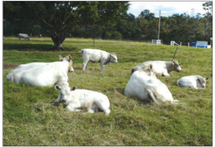
Rosellinos stud open day allows visitors to inspect the herd in the paddock.

This past year a young bull, Vesco Double Trouble, was purchased and has been used over the herd. This bull was Junior Champion at the Brisbane RNA and from Vesco Belle of the Ball, who was Champion Cow Brisbane RNA 2008, a daughter of the great breeding cow Domvale Treasure, and by Rainbow Ace of Hearts.