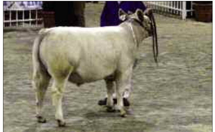
Lightweight Champion, Melbourne Royal Show.