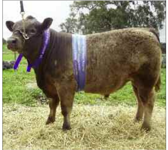
Willows Rest Adonis, 8 months, was Junior Champion Interbreed at Murray Bridge Show 2010.