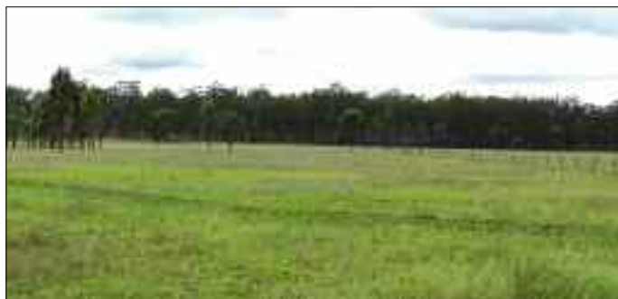
Stocking rates on unimproved pastures will be considerably less.