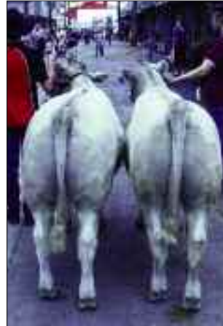
3rd Stanhill Trophy, Sydney Royal Show.