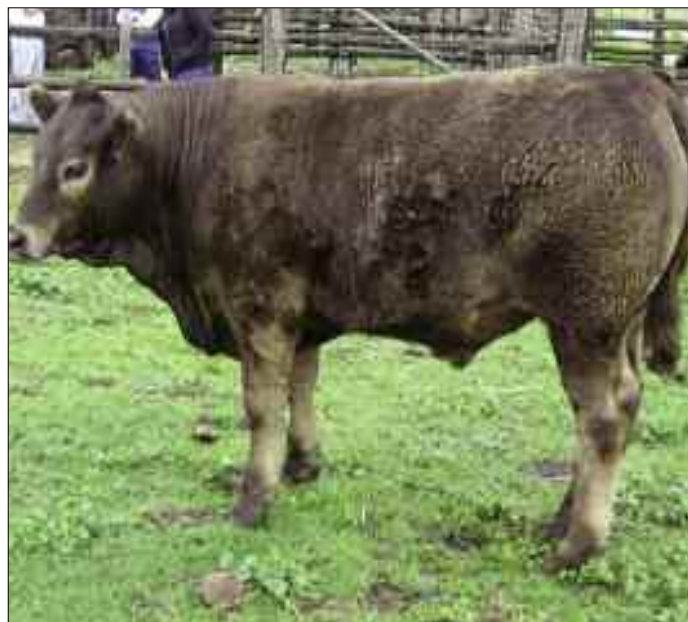
Square Meaters x Limousin cattle demonstrate strong Square Meaters traits.

The Limousin has never been able to fatten easily for an early market, even though they are well regarded by some for the taste of their meat. The breed has traditionally been a bit temperamental and lacks the softness of the Square Meaters. It will also probably never finish with the 7 to 9mm fat cover at 400kg live weight required for the butcher trade. The Square Meaters cross however completes the