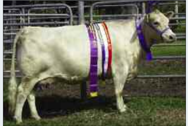
Rainbow Puddin Toowoomba Royal Agricultural Show Grand Champion Female