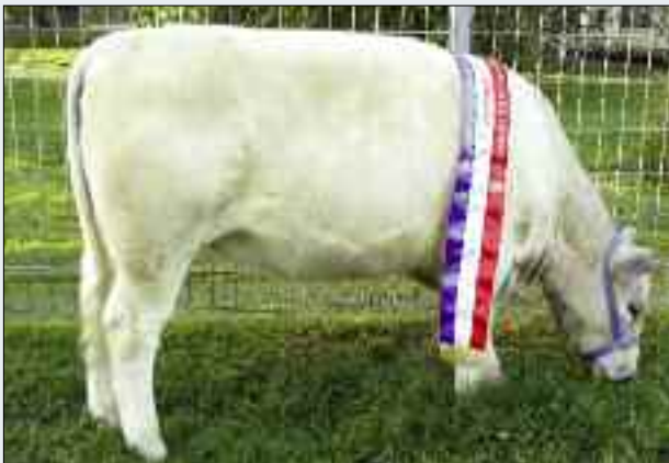
Rosellinos Erica's Eungella Pine Rivers Show Grand Champion Female