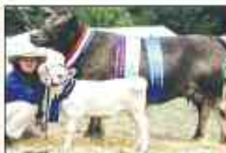
Rainbow Estate Mare Y15