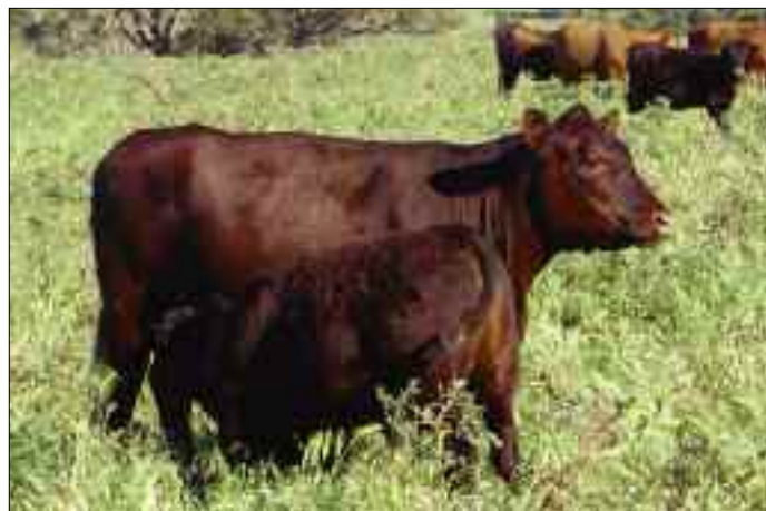
Dangaragan hope that by crossing Square Meaters it will help climate proof Australian farms.

Another key change has been the addition of perennial grasses. These grasses have made an enormous difference to our pastures, soil quality and our business. The grasses thrive if there is any summer rain and the permanent ground cover means that soil microbes flourish and humus builds