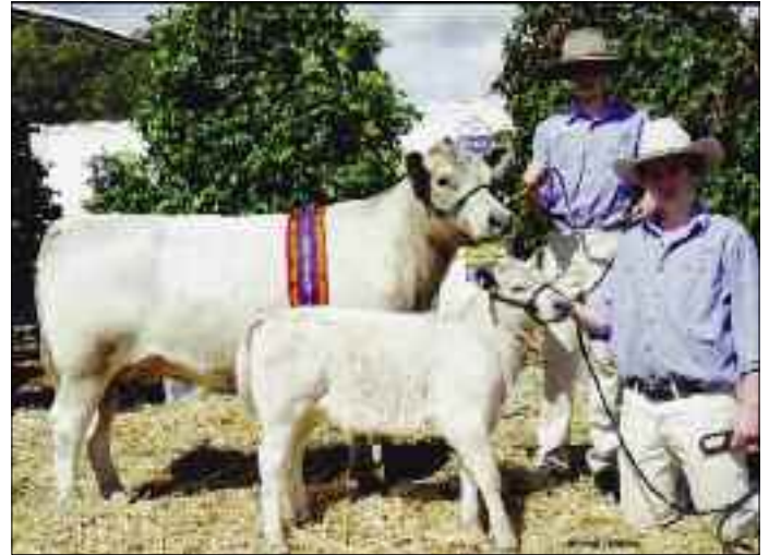
Award winning genetics used in paddock to plate business