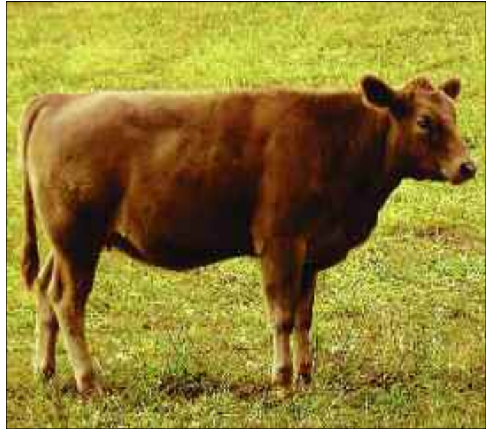
Grass finished Square Meaters will fuel expansion of the breed in the USA.

Windswept Farm, in anticipation of their relocation to southwest Iowa in mid 2011, is expanding with the purchase of several high quality Murray Grey females and possession interest in a Caloona Trouble son.