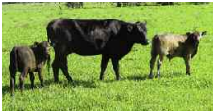
An Angus x Santa cow with her Square Meaters sired calf.

"The feedback from the butchers who have bought our vealer and yearling steers has been great. All up our Squares are delivering everything we expected and wanted." ■