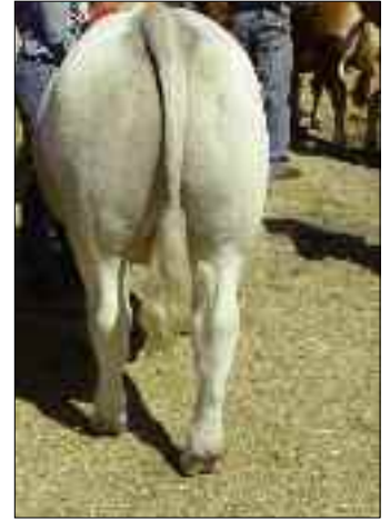
Reserve Middleweight Carcass, Perth Show.