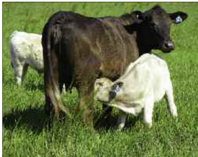
Crossing with Square Meaters provides early maturity traits in larger framed breeds.

A breeder who only breeds for export has just one crack at the market. This comes at the very end of a long growth stage. If the prices and conditions are unfavorable at the time of sale then that is too bad. Cattle that are not in good condition and ready to go to market will suffer a price markdown. By adding a