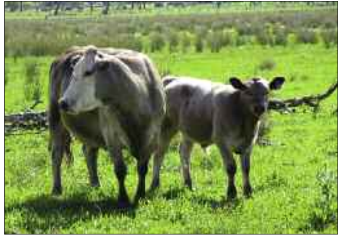
A 3 month old Square Meaters sired calf and his crossbred dam.

"We have had no calving problems at all, and while