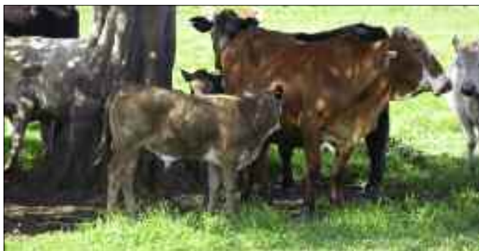
Note the great body shape of this Square Meaters cross bos indicus calf.