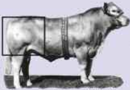
Reference Sire:Thurloo Park Sako