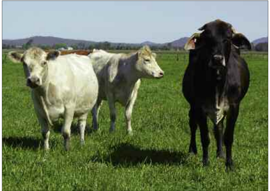
Research is showing, and leading producers are confirming, that moderate frame cows such as Square Meaters have a reproductive and production edge over larger framed females

“A cow that weighs 1000 pounds (446 kg) can easily wean off 50 percent of her own body weight. In contrast, it is much harder