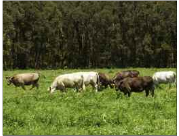
Silver Gully Estate quality grass fed, free range beef.

“Why were we asked? Consistent quality is the answer; there was no room for error at this luncheon