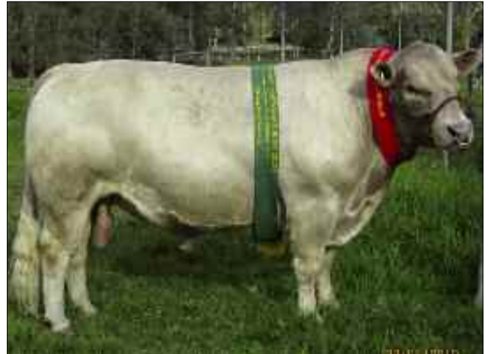
Rosellinos Square Meaters Stud has had tremendous success with their animals in the show ring during 2010.

Square Meaters Cattle is in quality beef, early maturing 350 to 450 kg at 12 to 15 months and efficient converters of feed. We are planning to prepare steers for the Led and Carcase competition in the future, and presently negotiating with a High School to prepare our animals.