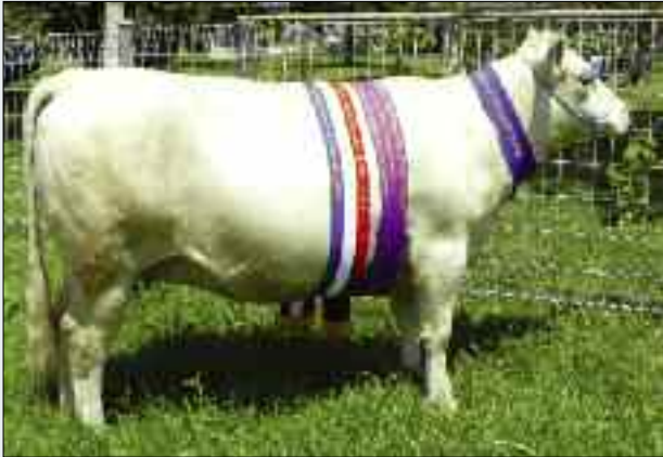
Rosellinos Diamond Brisbane Royal National Show Grand Champion Female

Exhibited at 3 shows during 2010 Won Grand Female Champion at each show, with 3 different animals.