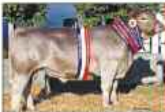
Rainbow Estate Yucatan