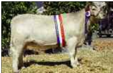
Woolaringa Bonnie D7

Woolaringa for: Temperament, Fertility & Consistency