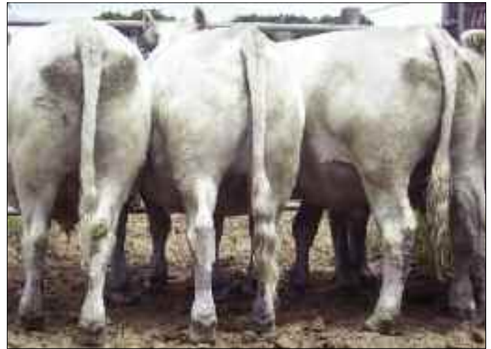
Woolaringa bred steers that fit the butcher trade.

Some processors provide basic carcass information that is linked to the NLIS system. Alternately producers that supply direct to a butcher can ask to see the carcasses, so they can visually compare the carcass to the live animal. ■