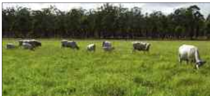
Pasture improvement provices greater output.

case on country that has been farmed in the past with fodder and crops being removed with no replacement of the nutrients. ■