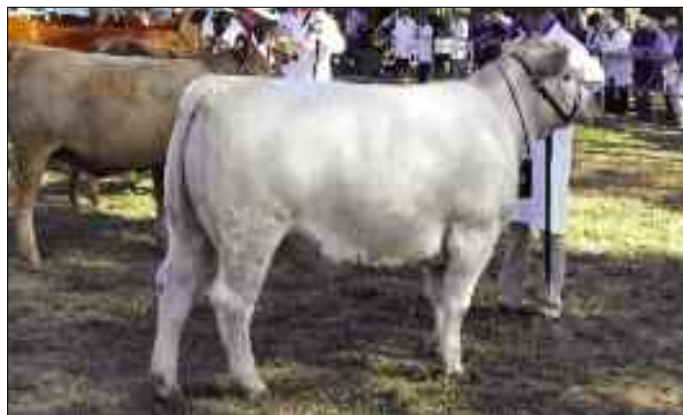
High School student presents Square Meaters steer against all comers in Steer Competition

1 You give the animal to the school who breaks it in, feeds it, prepares it for showing (clipping etc) transports it and exhibits it.