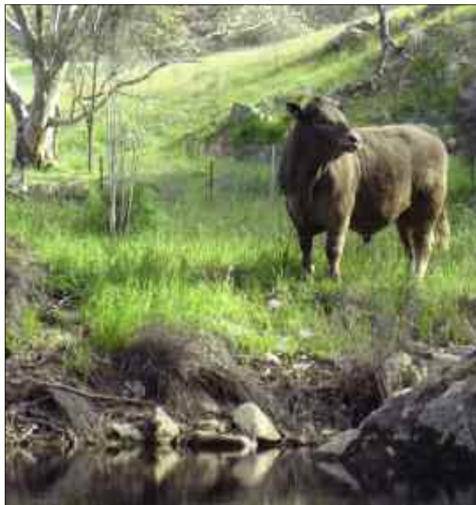
Rainbow Valley Square Meaters Stud are delighted with the recent drought breaking rains and their property looks great.

We are indeed fortunate to have such a wonderful breed of cattle and an association which is always there for us. The pot of gold at the end of our rainbow here in Rainbow Valley is still looking golden! ■