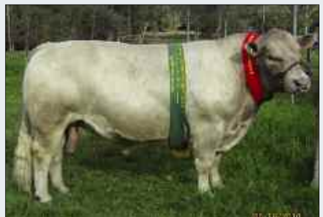
Vesco Double Trouble Res Champion Senior Bull Brisbane Royal National Show 2010